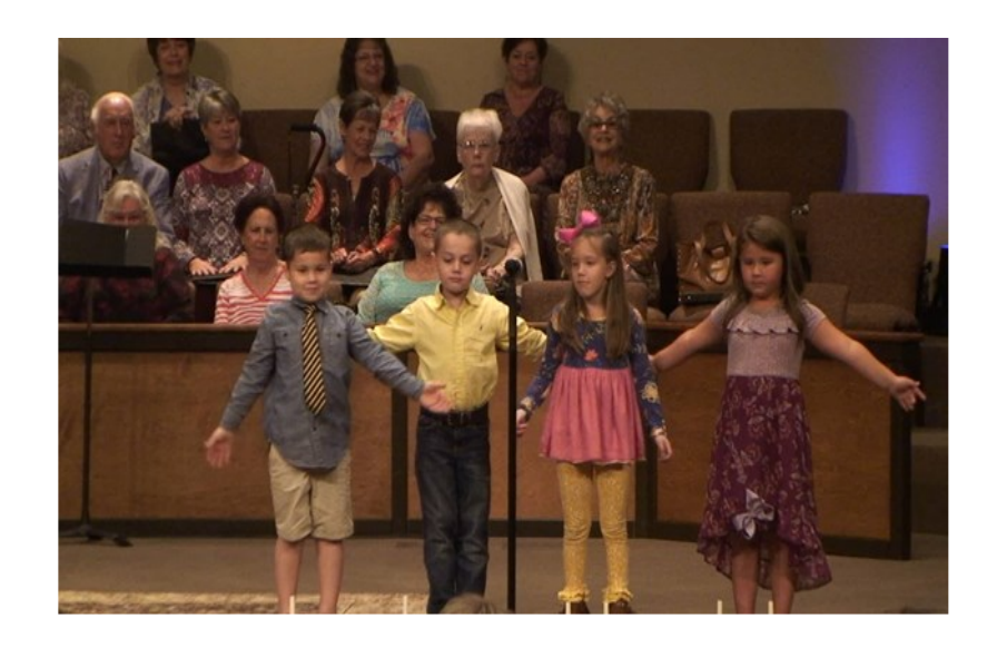
Happy Spring and Happy Easter!

The children enjoyed getting ready for Easter at the end of March. They learned a new bible verse during Chapel, "Hosanna, blessed is He who comes." We made some Easter crafts and celebrated Jesus together.