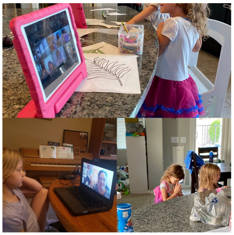
We loved spending time with our kids this summer learning, experimenting, and playing!