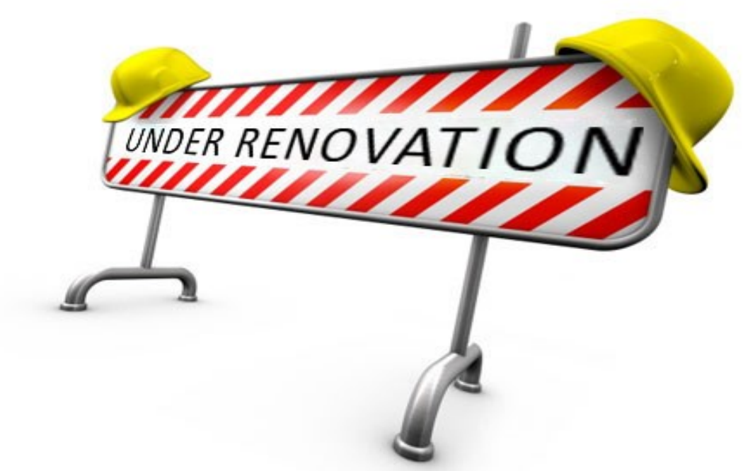
The Narex and Narex Bathrooms are under construction now!