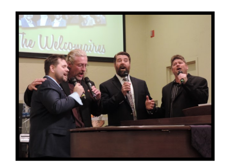
Sunday, March 13th Supper at 5pm Concert at 6pm

Last year as part of the Centennial Celebration the Welcomaires amazing harmonies of traditional gospel music.. We are overjoyed to have them back!