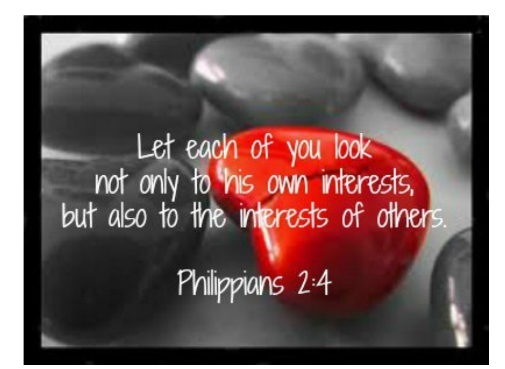
Our mission is to lead people of all ages on the journey to become deeply devoted followers of Jesus.